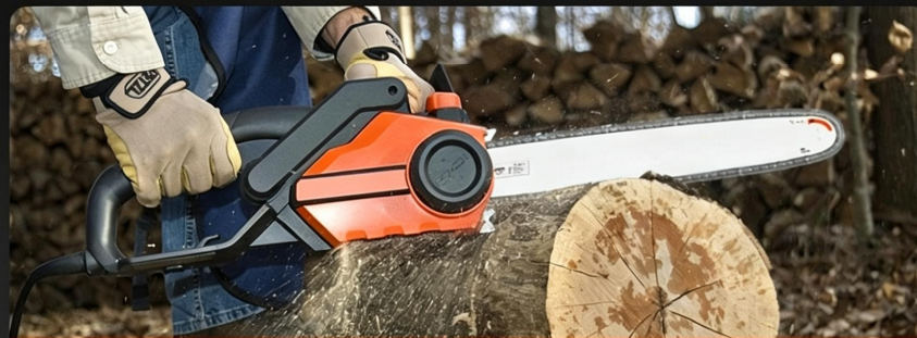
Chopping firewood and cutting branches

Satisfy different needs We have what you need