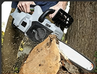
Log making and wood cutting